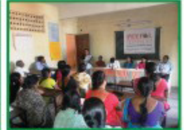
Parents in rapt attention at the empowerment workshops

"My daughter has improved a lot. She used to throw her school bag anywhere, but now she doesn't. Also, she helps her younger sister in studies."